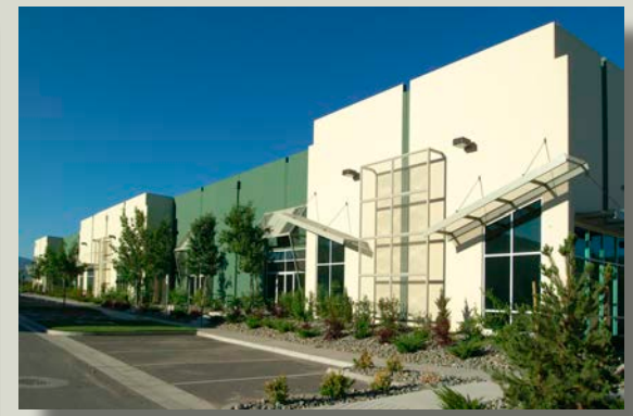
16 ACRE - FOOTHILL COMMERCE CENTER - RETAIL SHOWROOM - 212,000 SF