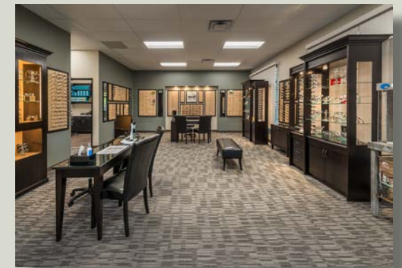
VARIOUS RETAIL BUILDINGS & INTERIORS