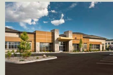
75 ACRE - RENO CORPORATE CENTER - THREE OFFICE CAMPUSES / MEDICAL CAMPUS & FLEX OFFICE CAMPUS - 556,500 SF