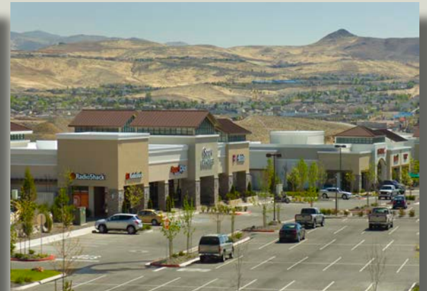
72 ACRE - SPARKS GALLERIA - 428,000 SF POWER CENTER ANCHORED BY COSTCO & HOME DEPOT