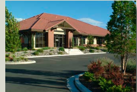
11 ACRE - DOUBLE DIAMOND PROFESSIONAL CAMPUS - 120,000 SF OFFICE CAMPUS