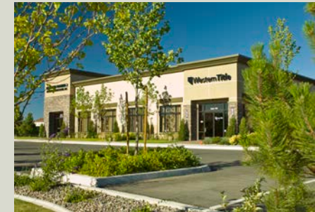
9.5 ACRE - VINEYARDS PROFESSIONAL CAMPUS - 92,000 SF OFFICE CAMPUS