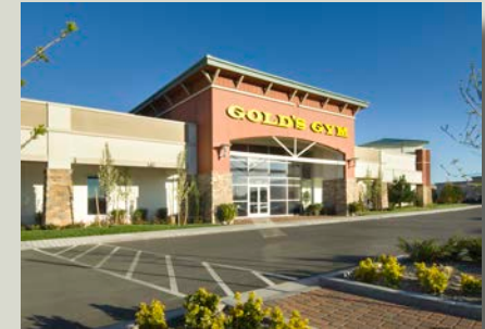
10 ACRE - LONGLEY TOWN CENTER - 112,000 SF SPECIALITY RETAIL CENTER