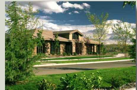
72 ACRE - RENO TAHOE TECH CENTER - 4 OFFICE CAMPUSES & TWO HOTELS - 782,000 SF