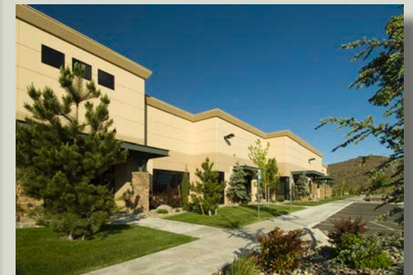
12 ACRE - SANDHILL BUSINESS CAMPUS. - FLEX OFFICE - 163,000 SF