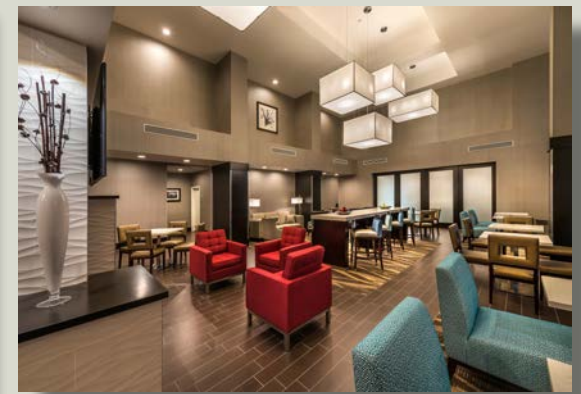
HAMPTON INN HOTEL - 86 ROOMS